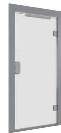
FULL GLASS PANORAMIC DOOR WITH STEEL-CLAD DOOR-FRAME OF THE CUSTOMER'S CHOICE