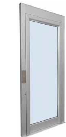
PANORAMIC DOOR IN NATURAL ANODISED ALUMINIUM