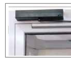
Automatic swing door operator