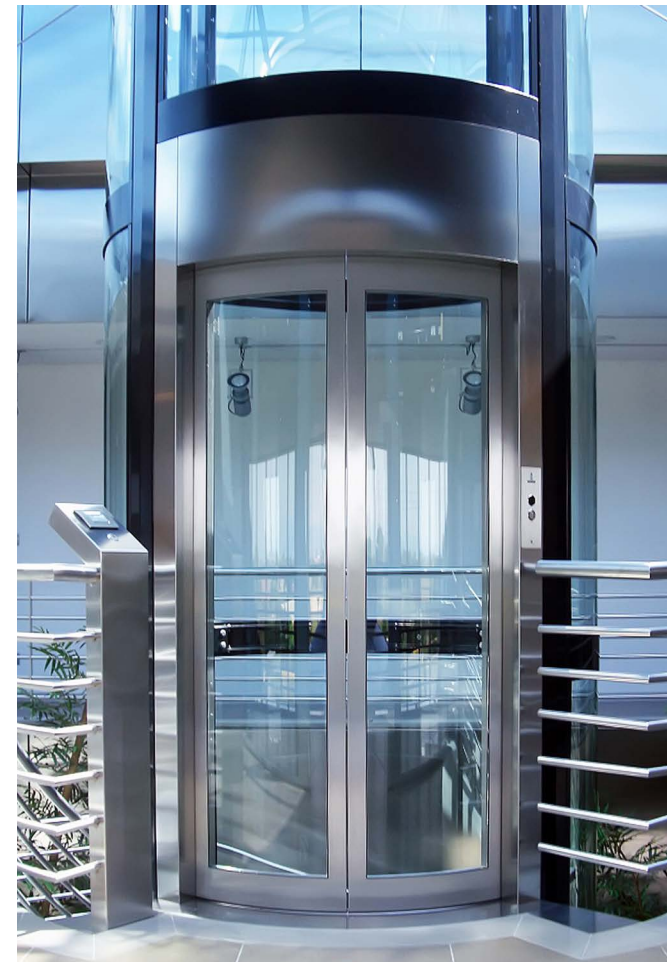
ROUND PANORAMIC DOOR-LEAVES