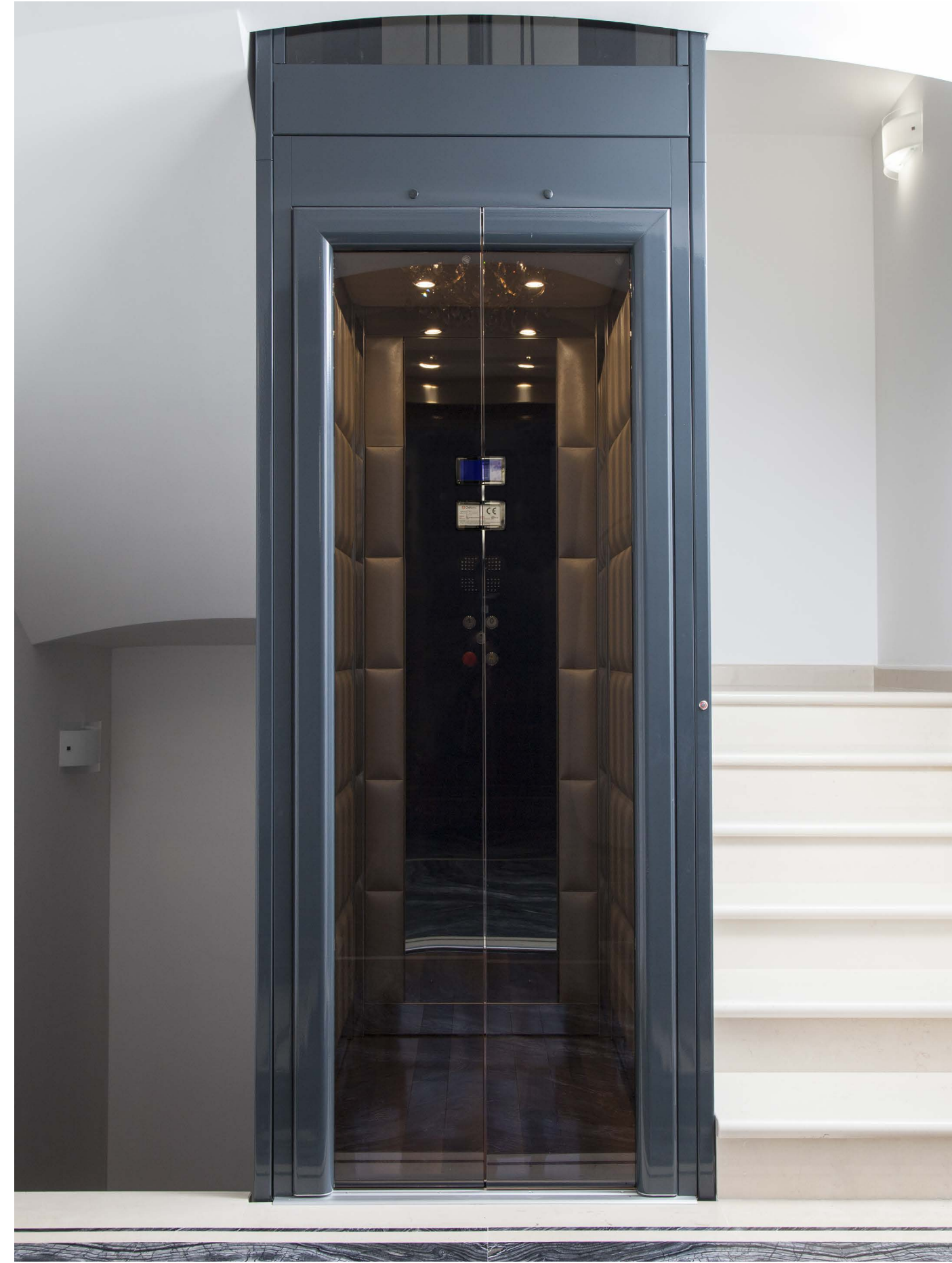
AUTOMATIC GLASS DOUBLE-LEAF DOOR