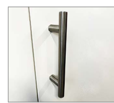
Door handle bar