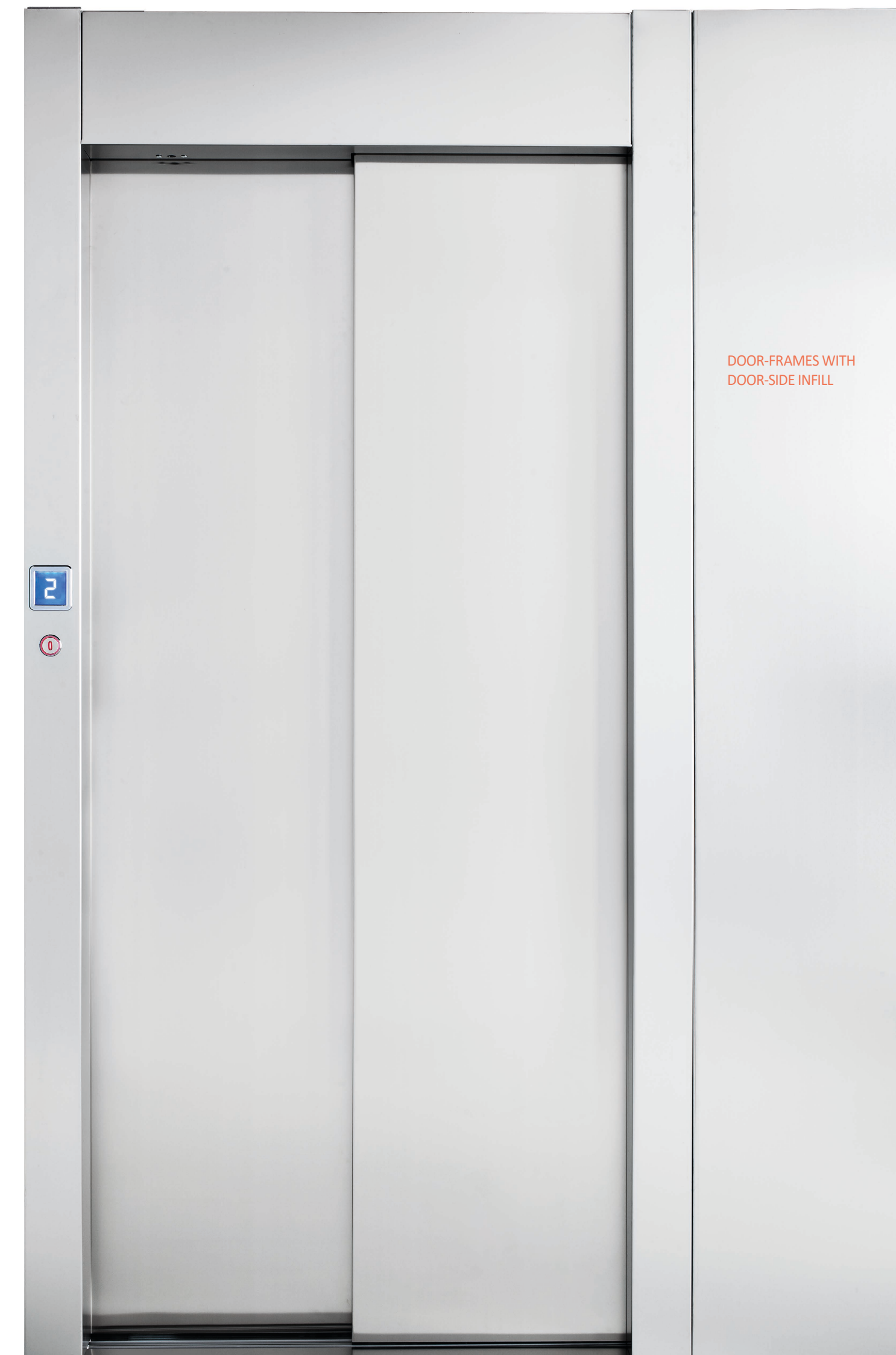
DOOR-FRAMES WITH DOOR-SIDE INFILL