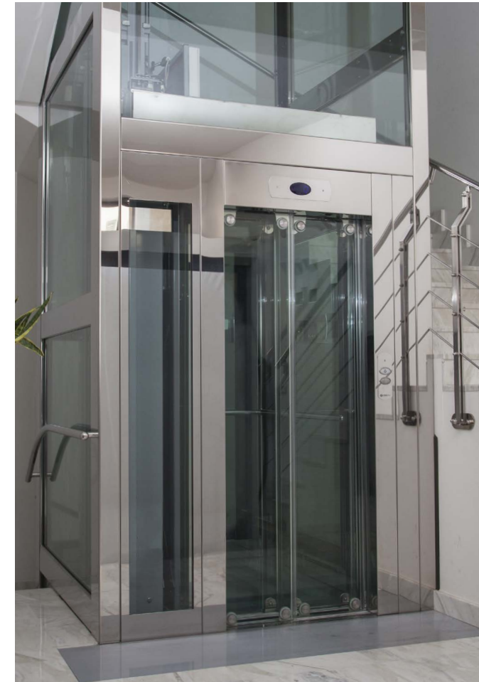
FULL GLASS SLIDING DOOR-LEAVES WITH STEEL TACTILE STUDS