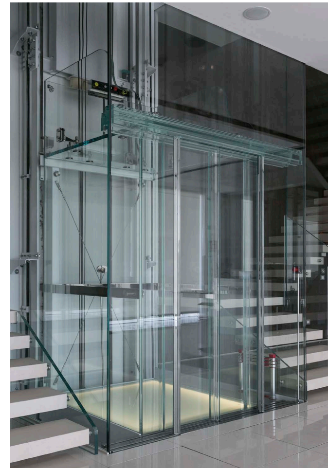
FULL GLASS DOOR-LEAVES