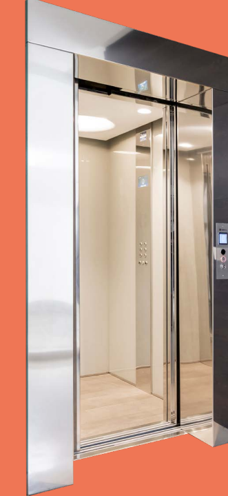
FOLDING DOOR IN ANODISED ALUMINIUM OR IN STEEL